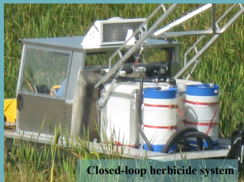
Closed-loop herbicide system