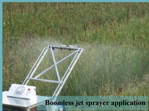
Boomless jet sprayer application

At FDC Enterprises we pride ourselves on providing excellent customer service and superior results. Whether you are looking to control phragmites in a riparian zone or re-create a wetland mosaic where cattails have taken over, FDC Enterprises can meet your needs. “The Labrador” is a FDCE custom built rubber tracked amphibious machine for chemically controlling vegetation that grows at the water/land interface. Our equipment and methods offer you a superior alternative to aerial application.