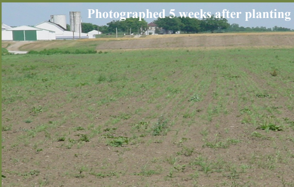
Photographed 5 weeks after planting