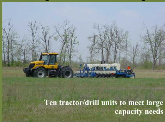
Ten tractor/drill units to meet large capacity needs

Our extensive "attention to detail" is the reason this Program is so successful. As one government official recently stated- "FDCE Program successes are writing new "Standards"