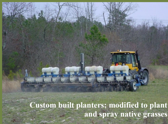
Custom built planters; modified to plant and spray native grasses