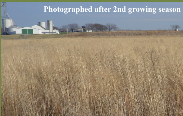
Photographed after 2nd growing season

At FDC Enterprises we pride ourselves on providing excellent customer service and great results. Our certified staff biologists will take the time to show you the planting and chemical application process and help you understand the program from start to finish. There's no need to line up separate contractors for seed, chemical, installation and follow up. FDC Enterprises offers a no hassle full turn-key operation. With over 109,000 acres of installation experience and a consistent 97.4% success rate we can make your experience an enjoyable one.