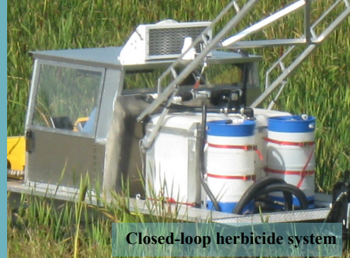
Closed-loop herbicide system