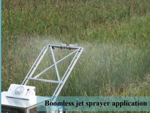
Boomless jet sprayer application

At FDC Enterprises we pride ourselves on providing excellent customer service and superior results. Whether you are looking to control phragmites in a riparian zone or re-create a wetland mosaic where cattails have taken over, FDC Enterprises can meet your needs. “The Labrador” is a FDCE custom built rubber tracked amphibious machine for chemically controlling vegetation that grows at the water/land interface. Our equipment and methods offer you a superior alternative to aerial application.